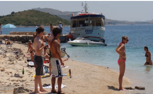
Our boat visits an island beach near Zadar

All instruction will be in English. The educational content of the program is one five-credit course that will cover: (1) an overview of the nature and structure of international business transactions; (2) an overview of mediation and arbitration as private means of resolving international commercial disputes; (3) a brief introduction to private international law and comparative contract law principles; (4) an in-depth study of the law governing international sales of goods, with a focus on the CISG; (5) an in-depth study of the law governing international commercial arbitration and enforcement of arbitration awards, with a focus on the UNCITRAL Model Law and the New York Convention; and (6) the development of analytical, research, oral advocacy, and written advocacy skills in the context of a dispute arising out of a practical problem based on a fictional international sales transaction.