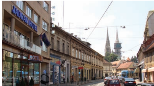
Program hotel in Zagreb (Jadran on left)

In Zagreb, students will be housed in a centrally located hotel – a convenient walk or trolley ride from the University of Zagreb where classes will be held. Breakfast will be provided at the hotel and lunch will be provided nearby. Students are on their own for dinner.