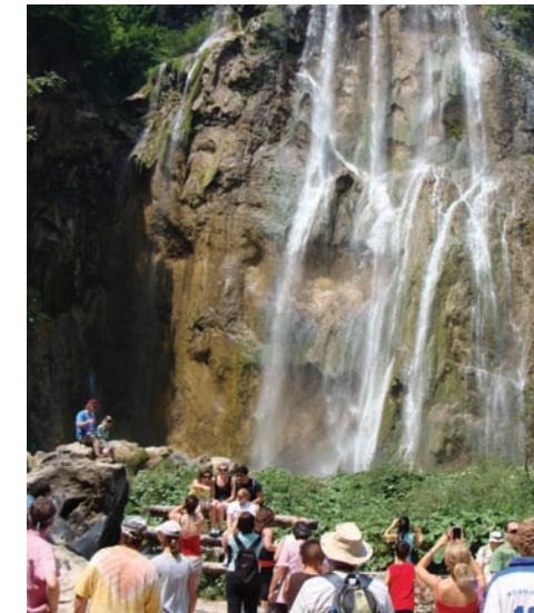
Waterfalls at Plitvice Lakes National Park

Please follow the Application Requirements listed on the previous page.