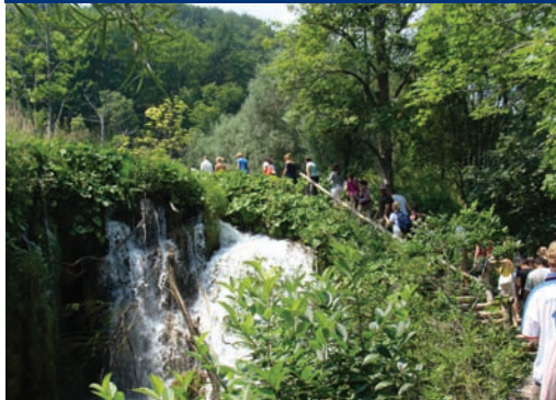
Visiting Plitvice Lakes National Park