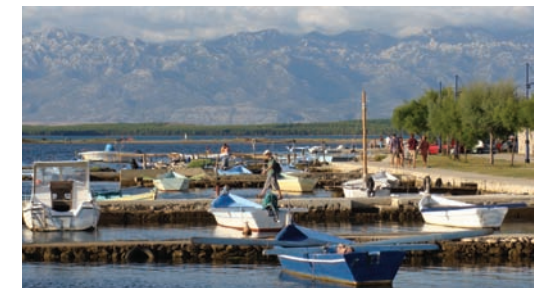
Nin and the coastal range in the background

The program sponsors reserve the right to modify or cancel the program for reasonable cause, including but not limited to insufficient enrollment, severe political instability, or any serious condition that may threaten the safety of the students. If the program is cancelled, any money paid by an applicant to the sponsoring schools will be fully refunded within 20 days, except for room and board and transportation payments utilized prior to the cancellation date. The program will endeavor to help each enrolled student attend a similar program, if the student so desires.