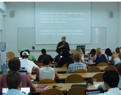
Classroom in Zagreb