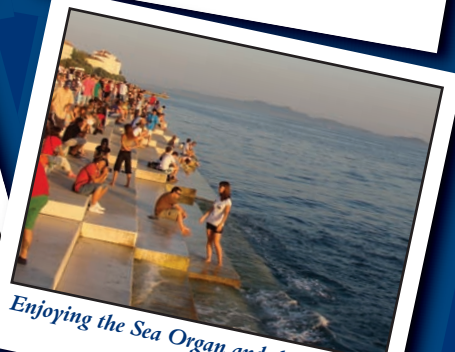
Enjoying the Sea Organ and the Adriatic