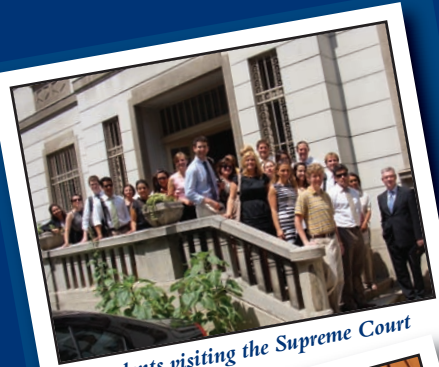
Students visiting the Supreme Court