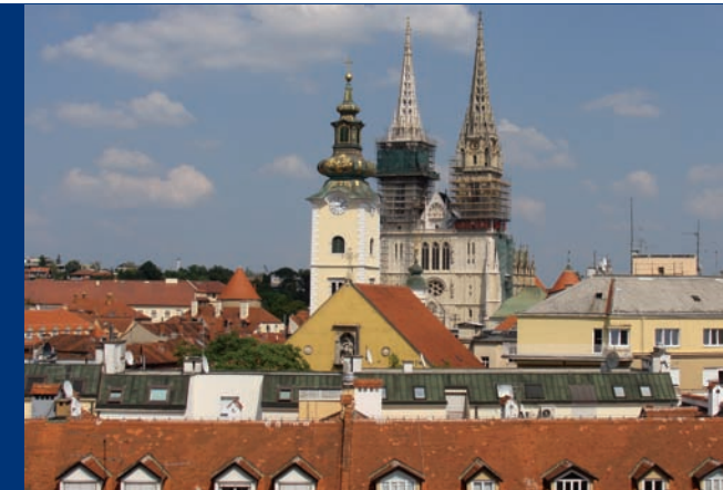
Cityscape of Zagreb, capital of Croatia

Arbitration Moot. The Institute will provide a uniquely international educational experience to students from multiple legal and educational backgrounds, as participants will be chosen from an internationally diverse group of law schools.