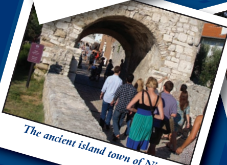
The ancient island town of Nin