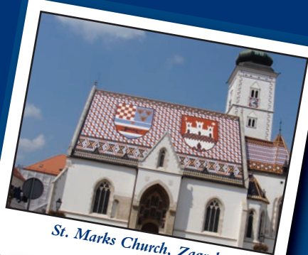
St. Marks Church, Zagreb