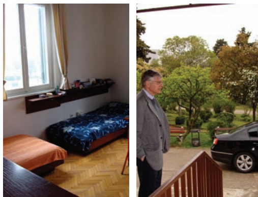
Zadar dorms inside and out

All classroom and dormitory facilities will include Internet access (computer labs and wireless access for your personal computer).